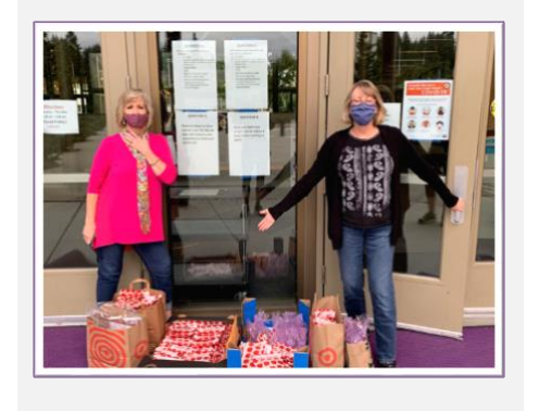
Thank you volunteers for donating cookies during Operation Cookie Drop Off to spoil IHS staff!

Local and nationally known experts share the latest information on effective parenting with Issaquah School District caregivers.